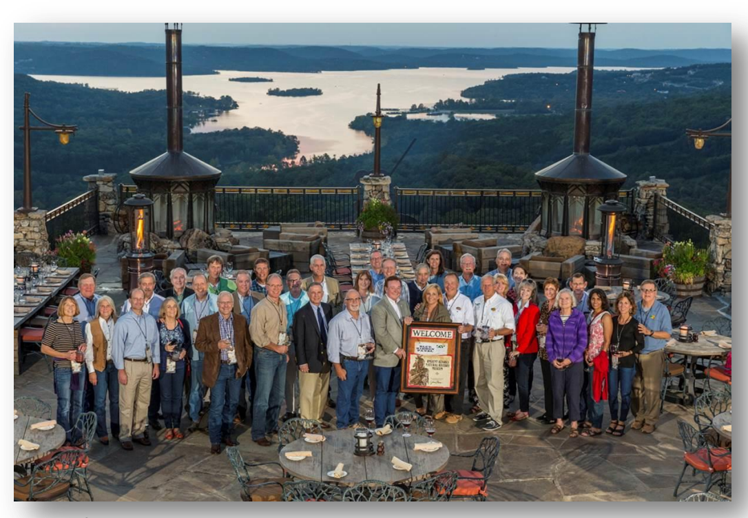
Photo of Blue Ribbon Panel members at Big Cedar Lodge in Missouri in September 2015

Answer- The Blue Ribbon Panel has created four working groups (Legislative, Communications, Business Relationships, Agency Relevancy) to advance their recommendations. Blue Ribbon Panel members are working with congressional champions to introduce legislation, develop a communications strategy, reaching out to business leaders for support and developing recommendations on how to ensure fish and wildlife agencies remain relevant in the future.