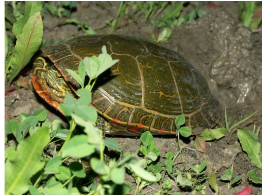
Painted Turtle Digging Nest