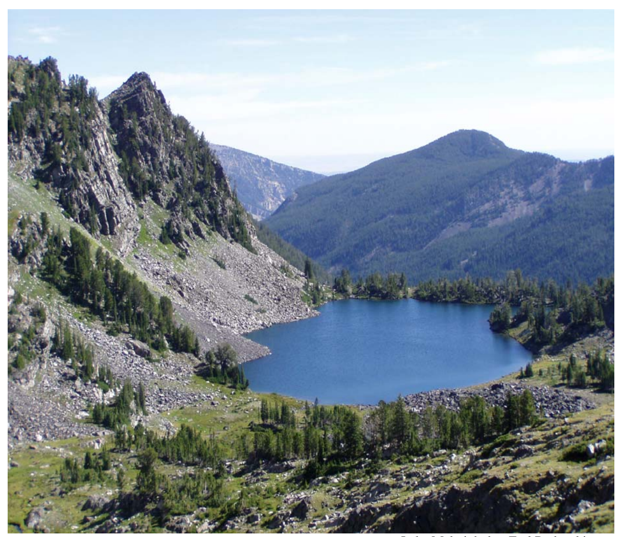
Lake Mcknight by: Earl Radonski