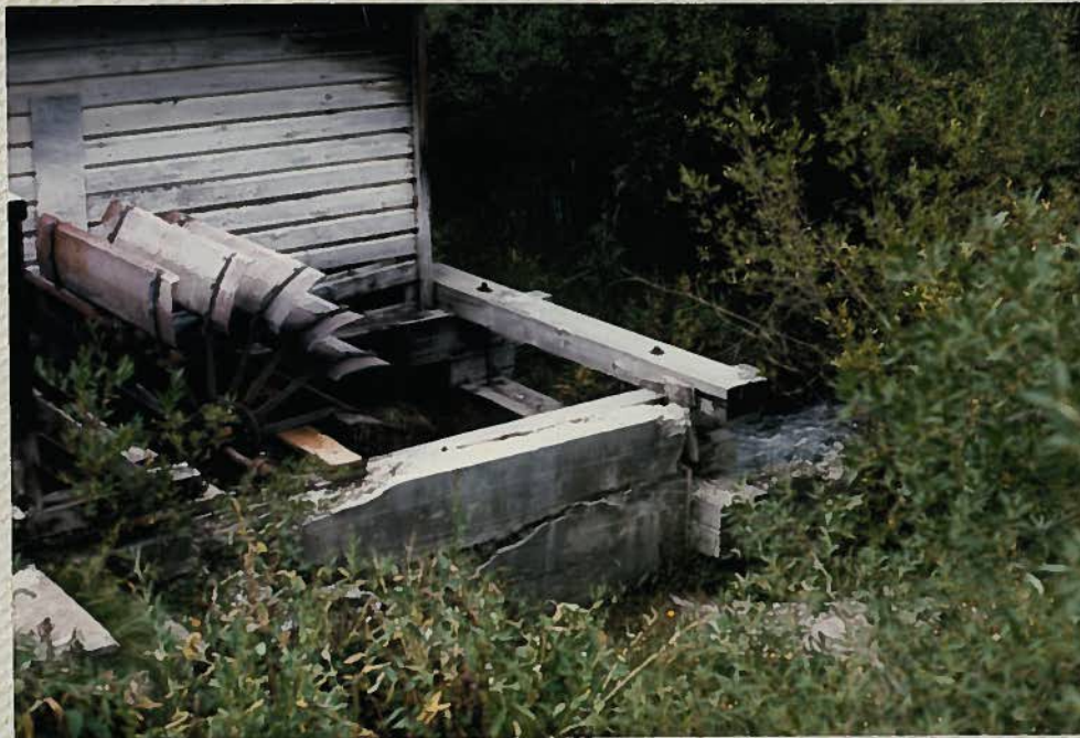
Stuart Mill Creek-at site of abandoned mill and water wheel.