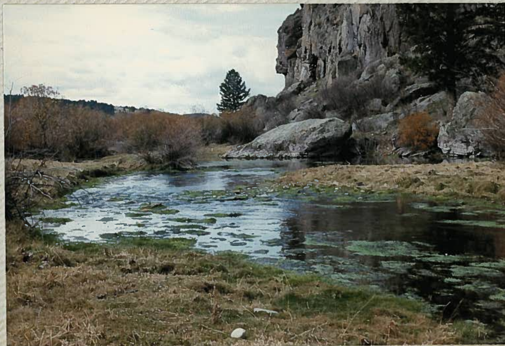
Little Blackfoot Spring Creek-upper channel.