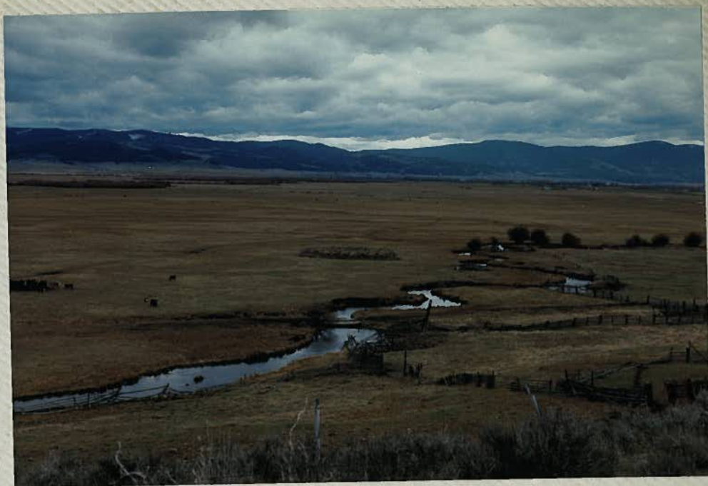
Nevada Spring Creek-note sloughing bank throughout channel.