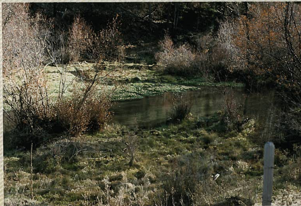
Warm Springs Creek upper channel below falls.