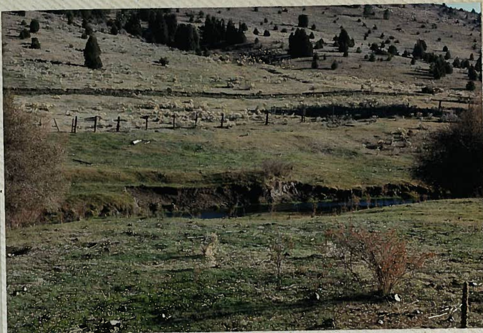
Warm Springs Creek lower channel on private land used for cattle grazing; note excessive bank slumping.