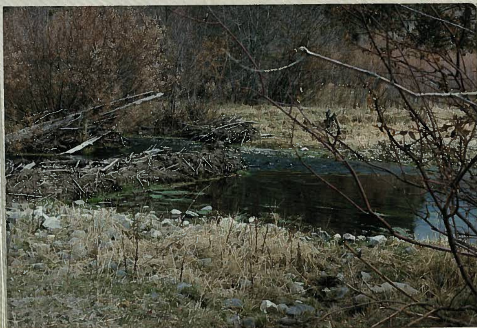
Little Blackfoot Spring Creek-outlet to Little Blackfoot River.