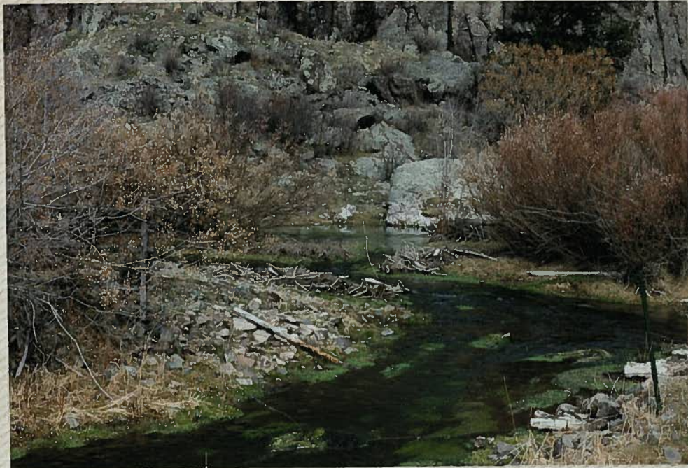
Little Blackfoot Spring Creek-near origin.