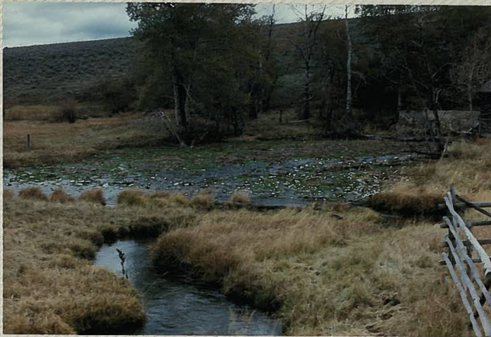
Nevada Spring Creek-spring source. Channel in foreground is irrigation channel.