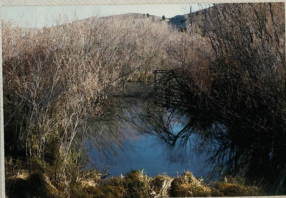
Warm Springs Creek near mouth; channel altered from beaver dams.