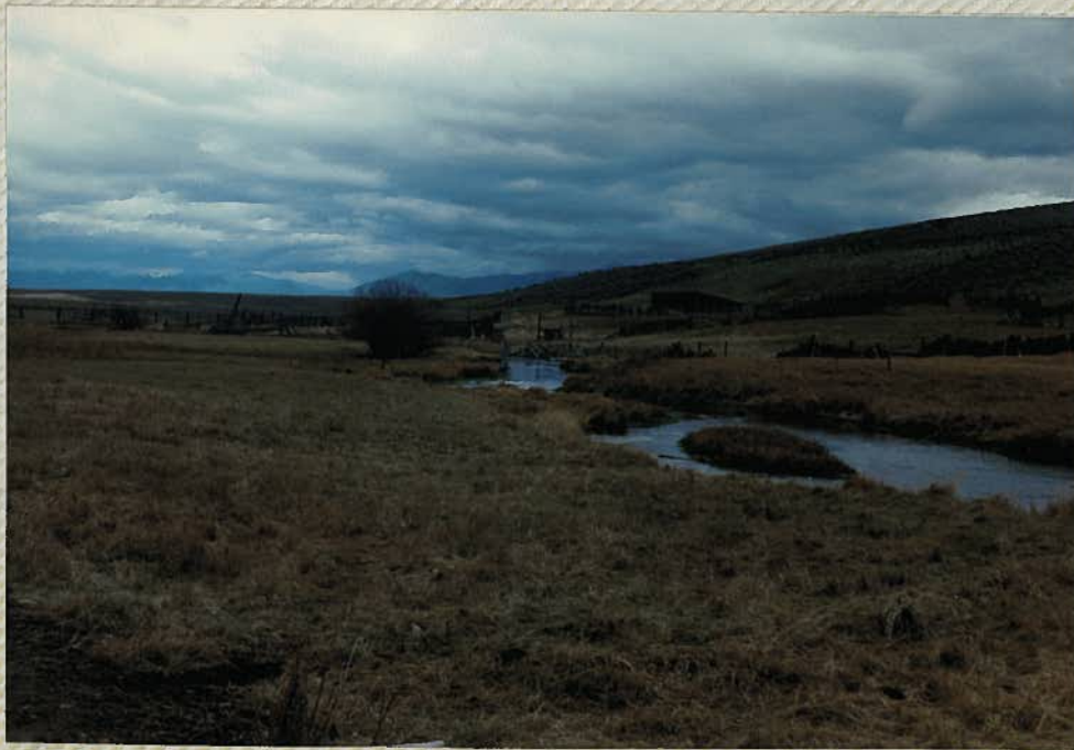
Nevada Spring Creek upper channel; note complete lack of woody riparian zone and sloughing banks.