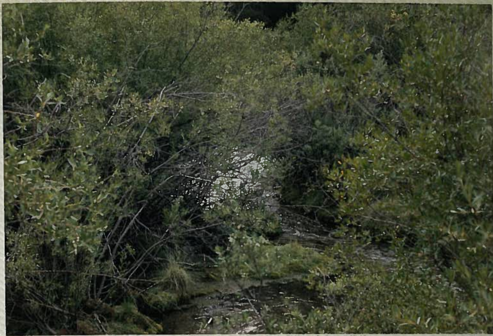
Stuart Mill Creek-above Georgetown Lake road.