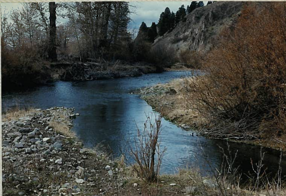
Little Blackfoot Spring Creek-lower channel; note beaver dam.