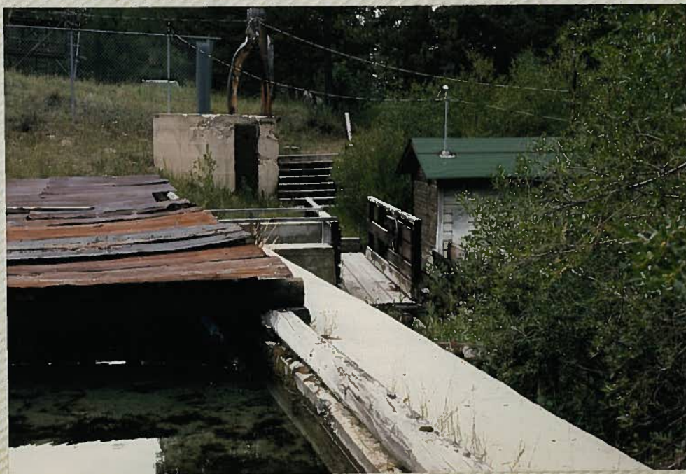
Stuart Mill Creek-at site of mill and reservoir area.