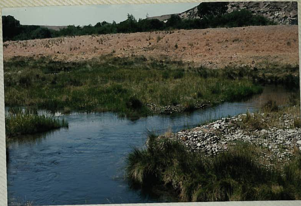
Darlington Ditch-- altered section.