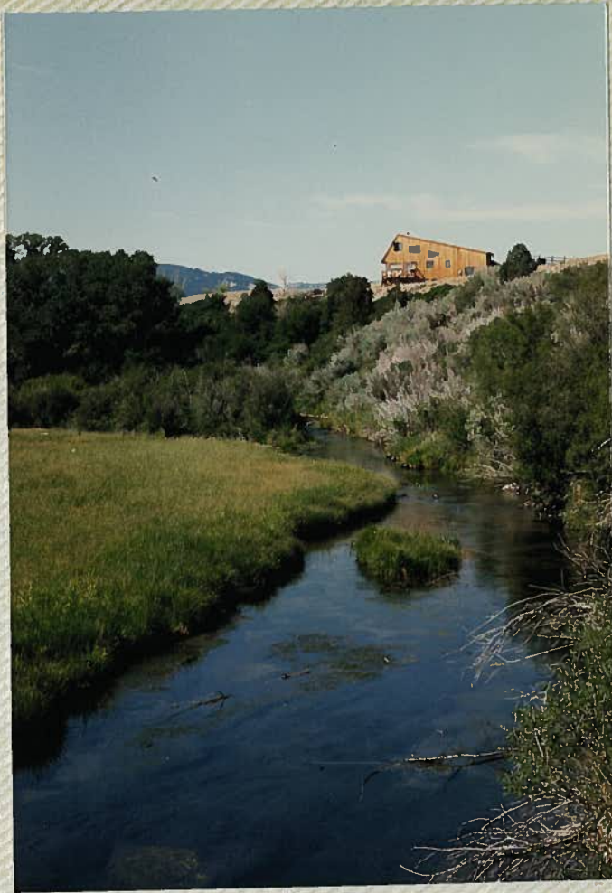
Blaine Spring Creek-upstream from lower road crossing; app 1 mile above outlet to Madison River.