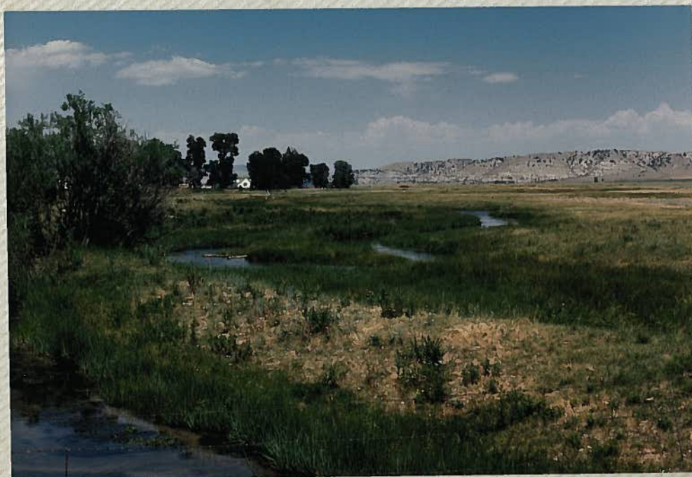
Rey Spring Creek-downstream from Madison River Road.