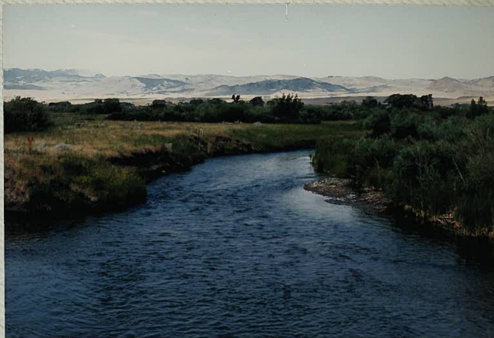
Odell Spring Creek-upstream from Highway 287, near Ennis, Mt.