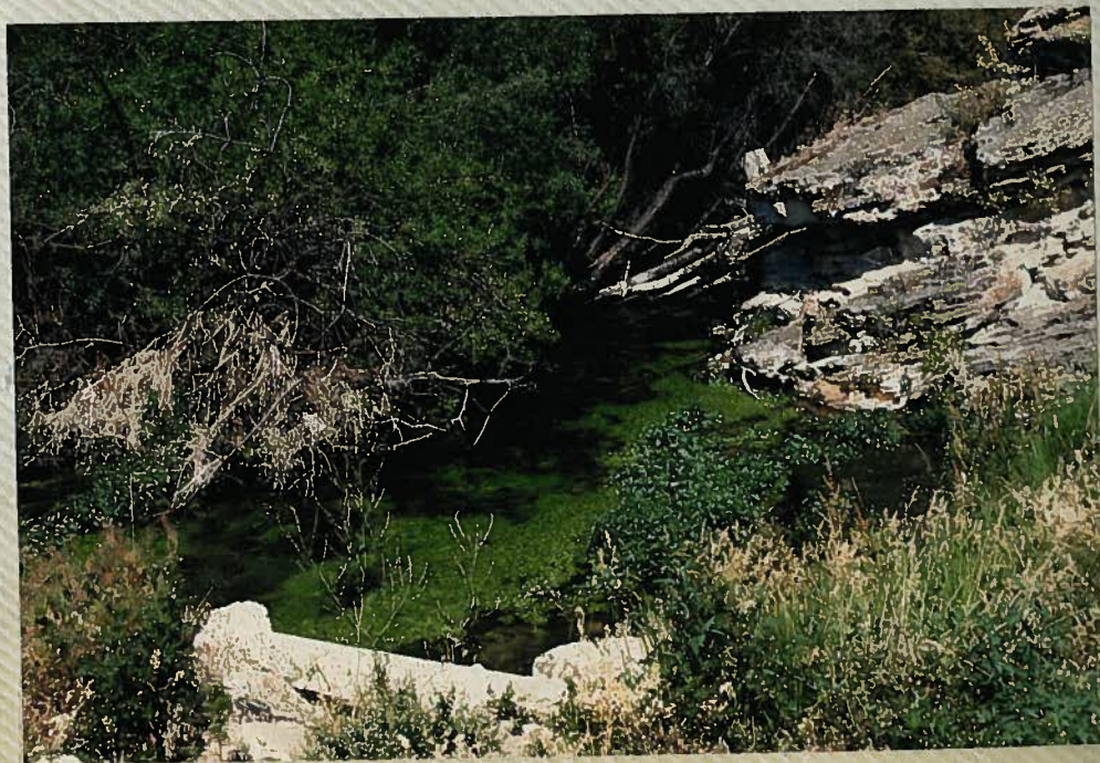
Blaine Spring Creek-app 1 mile below Ennis Fish Hatchery, above subdivisions