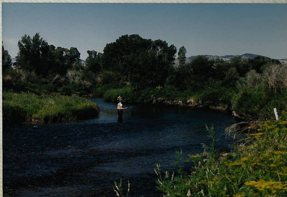
Odell Spring Creek-directly above mouth to Madison River at Valley Garden State Fishing Access.