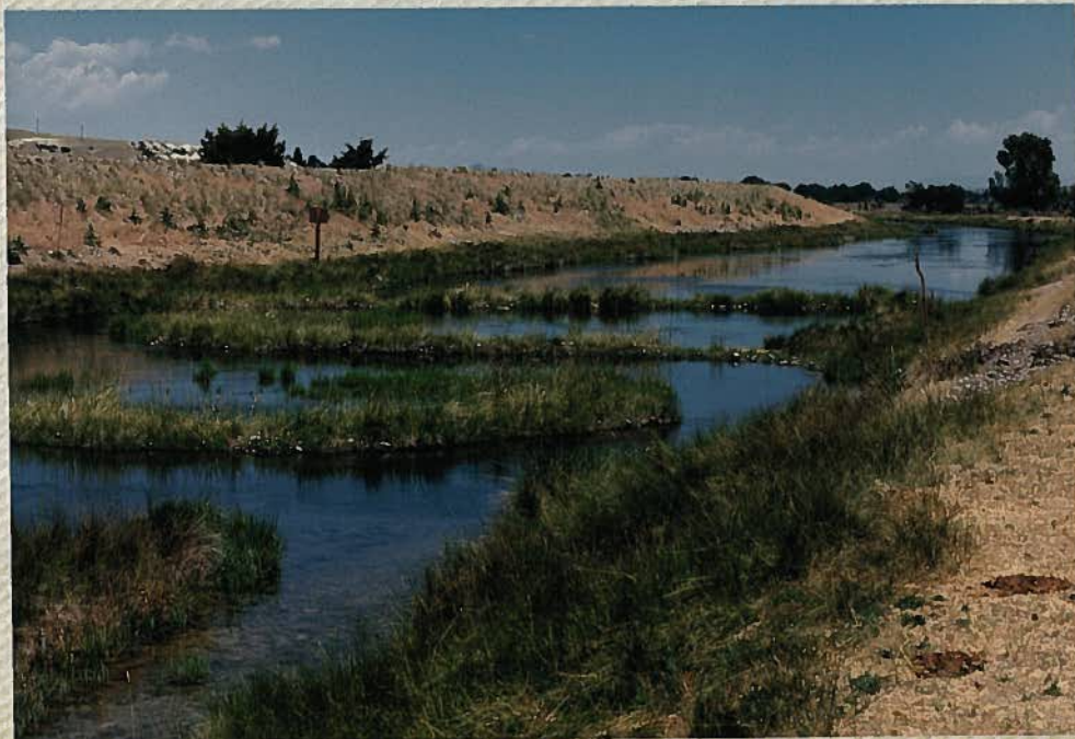
Darlington Ditch-altered section in foreground, unaltered section in background.