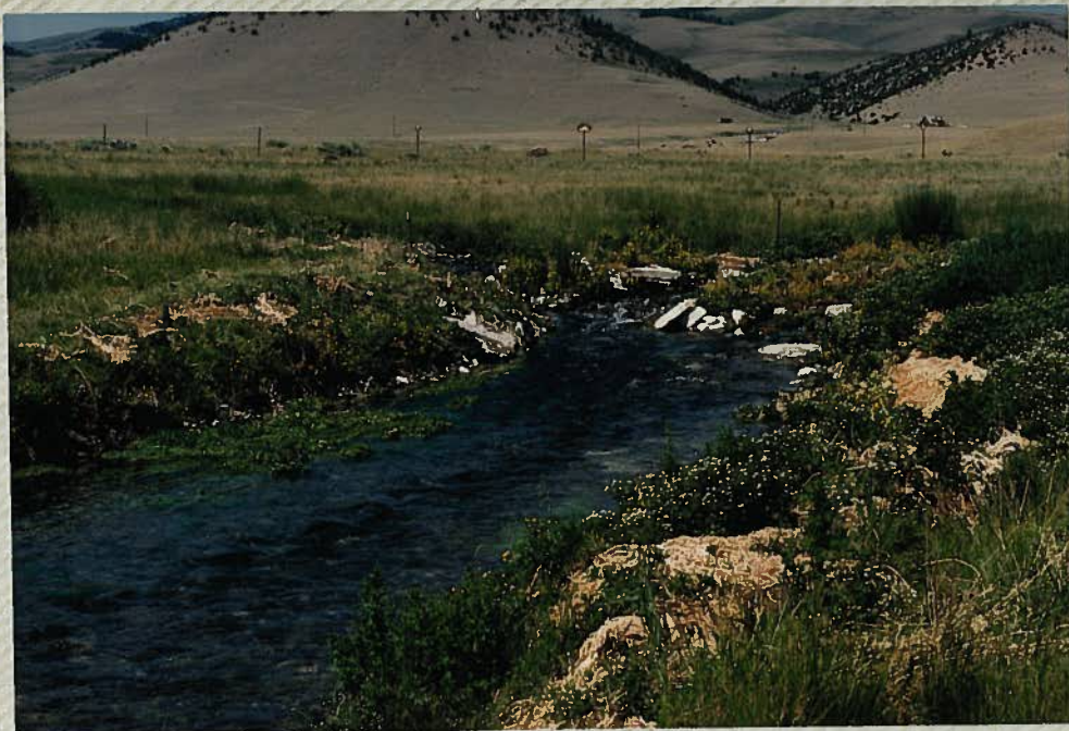
Blaine Spring Creek spring source.