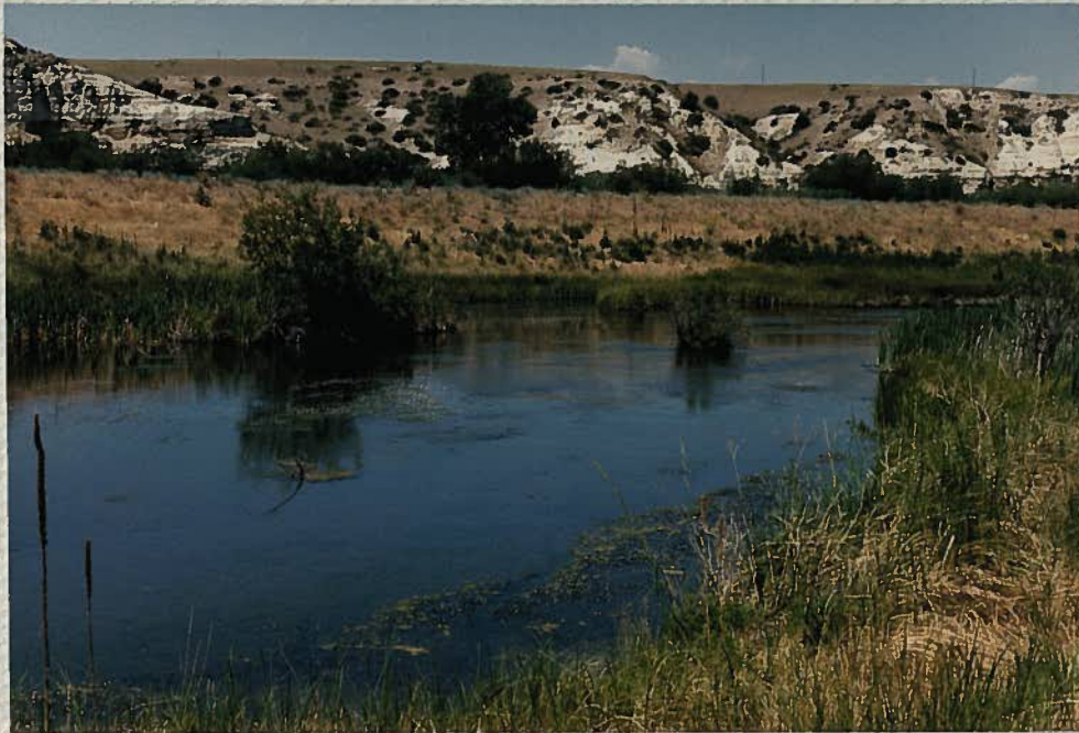
Darlington Ditch-unaltered section on state land.