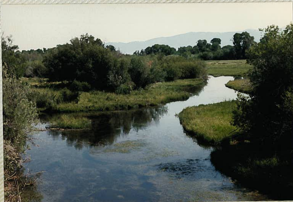
Blaine Spring Creek-downstream from lower road crossing; app 1 mile above outlet to Madison River.