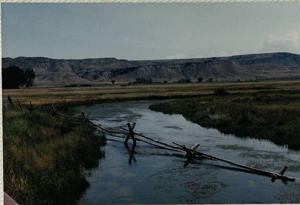
Rey Spring Creek-upstream from Madison River Road.