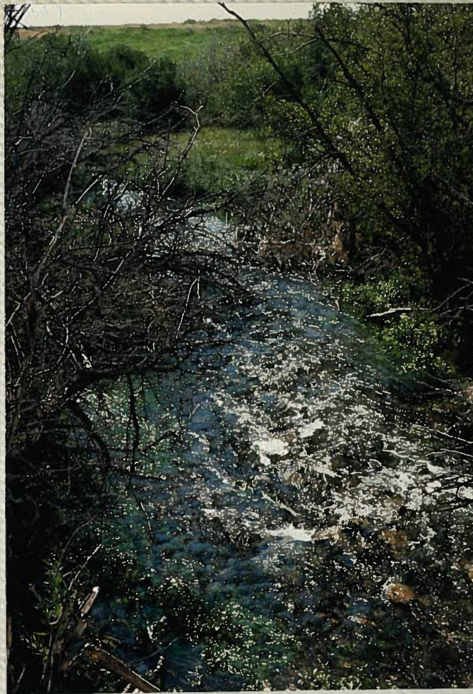
Blaine Spring Creek-app 1 mile below Ennis Fish Hatchery.