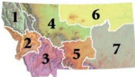
FWP Administrative Regions