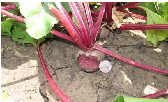
Fig. 5. A beet damaged by hungry voiles. Nickel used for scale.

Orchards, shelter belts and nurseries can experience damage when bark is shredded and the cambium layer is gnawed and eaten (Fig. 6). If 50 percent or more of the circumference is damaged, the tree or shrub will likely die. This type of damage occurs most often during fall and winter.