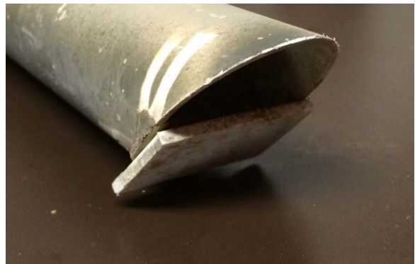
Fig. 12. (Top) T-style bait station using 2-inch PVC pipe. (Bottom) Close up of the end showing the end plate to prevent bait from spilling out of the station.

Whenever applying first generation anticoagulants (i.e. warfarin, chlorophacinone, diphacinone,) it is critical to maintain the bait supply for the number of days recommended by the label. Failure to maintain the bait supply will result in ineffective control because voles may receive a sub-lethal dose and upon recovering may avoid future bait application.