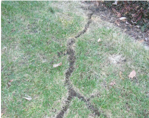
Fig. 4. Vole run that cut through the grass.

During winter months or times of drought, voiles often move from surrounding areas into yards, gardens, golf courses or cemeteries. They may burrow and create runways that damage lawns (Fig. 4) or gnaw and consume flowers and bulbs (Fig. 5).