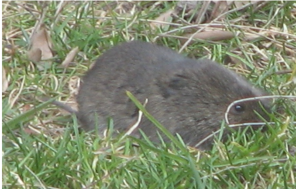
Fig. 1. Meadow vole.

Voles (often called meadow or field mice) have stocky bodies with short legs and short or long tails depending on the species (Fig. 1). They vary from gray to dark brown in color. Their eyes are small and the ears are inconspicuous.