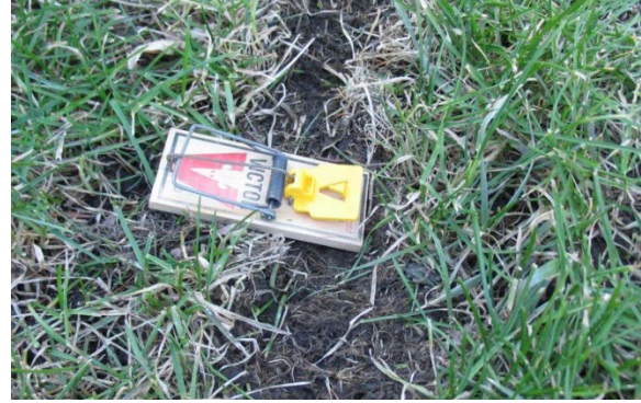
Fig. 8. Expanded trigger snap trap (unbaited) properly set in a vole run.

Baited snap traps are also effective but should be protected by an overhead cover to reduce attracting and injuring non-target animals, such as birds. Covers can be as simple as propping boards up with bricks or as fancy as fabricated triangular covers that may be staked to the ground (Fig. 9). Always ensure covers will not interfere with the firing of the traps. Effective baits include, apple slices or a peanut butter/oat mixture.