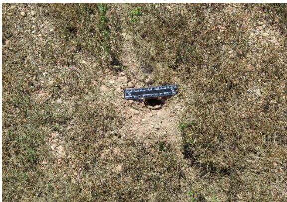
Fig. 3. A vole burrow (below ruler) and runs.

In general, voles prefer areas with a dense ground cover of grasses and litter. They live in underground tunnel systems with open entrances approximately 1 to 2 inches in diameter. These burrow openings are connected by a maze of one to two inch wide surface runways over the ground usually beneath vegetation or litter (Fig. 3). Interestingly, long-tailed voles tend not to create surface trails.