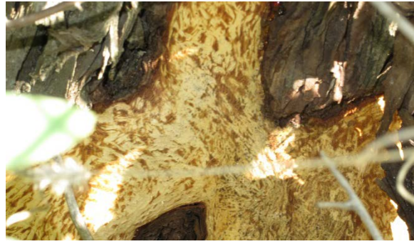
Fig. 6. A close-up of vole damage on the trunk of an apple tree.

Orchards, shelter belts and nurseries can experience damage when bark is shredded and the cambium layer is gnawed and eaten (Fig. 6). If 50 percent or more of the circumference is damaged, the tree or shrub will likely die. This type of damage occurs most often during fall and winter.