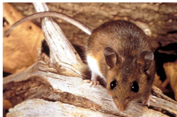
Fig. 2. Deer mouse.

Other rodent species that may occupy similar habitat that are sometimes confused with voles include the Deer mouse ( Peromyscus maniculatus ; Fig. 2) and the Northern pocket gopher ( Thomomys talpoides ). These species are easily distinguished from voles by appearance and habits.