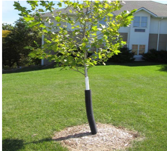
Fig. 7. Corrugated pipe (black) used to protect a tree.

Protect seedlings or young trees with metal flashing cylinders or rodent proof wraps. These barriers should be buried several inches beneath the soil surface and extend up the trunk of the tree beyond expected snow depth. Secure the top of the cylinders with mesh to prevent entrapment by crevice dwelling birds (Fig. 7).