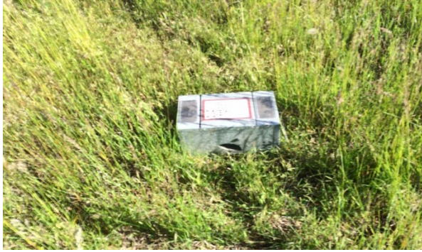
Fig. 10. A Ketch-All trap placed in a vole run.