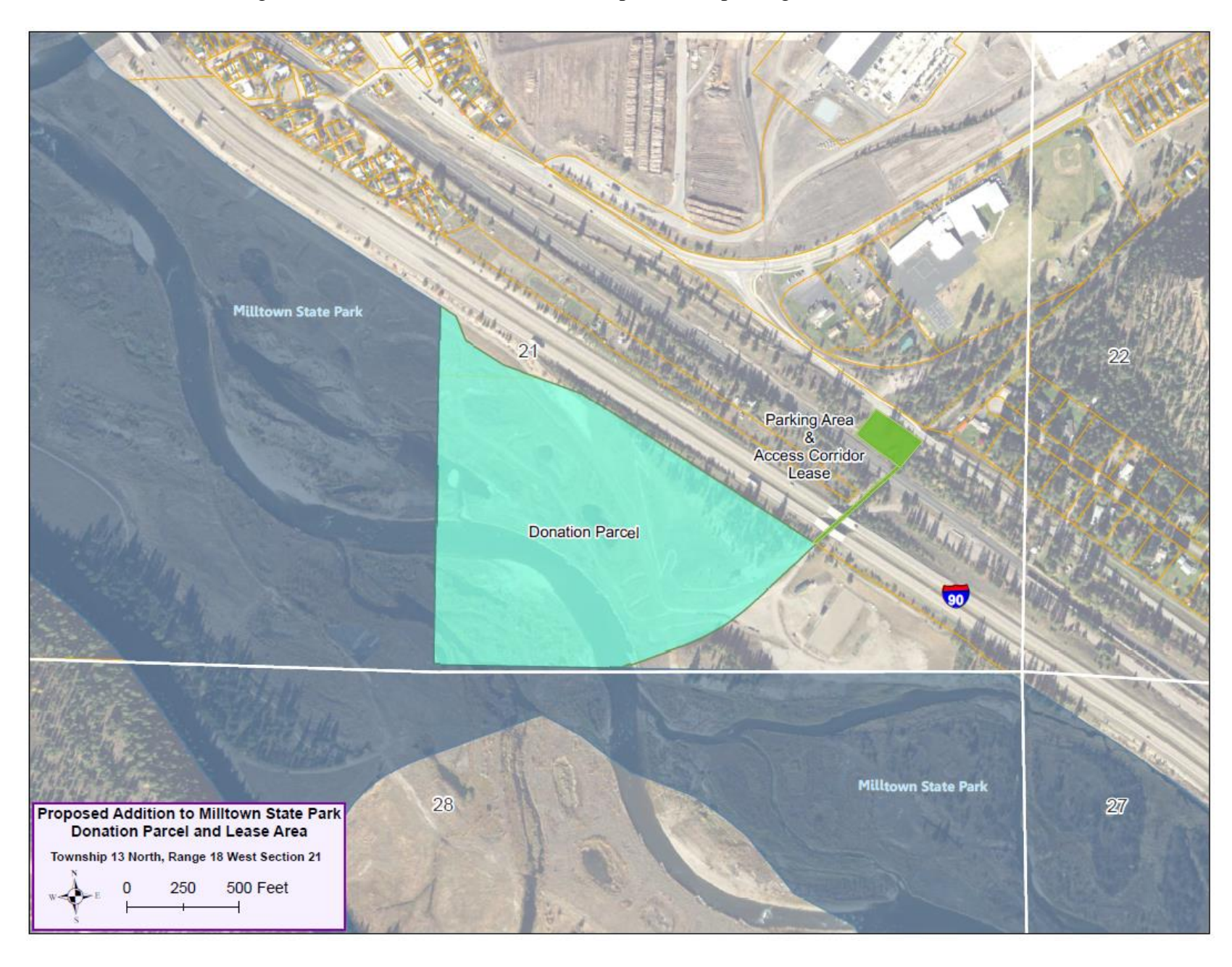
Figure 2: Milltown State Park, donation parcel and parking and access boundaries