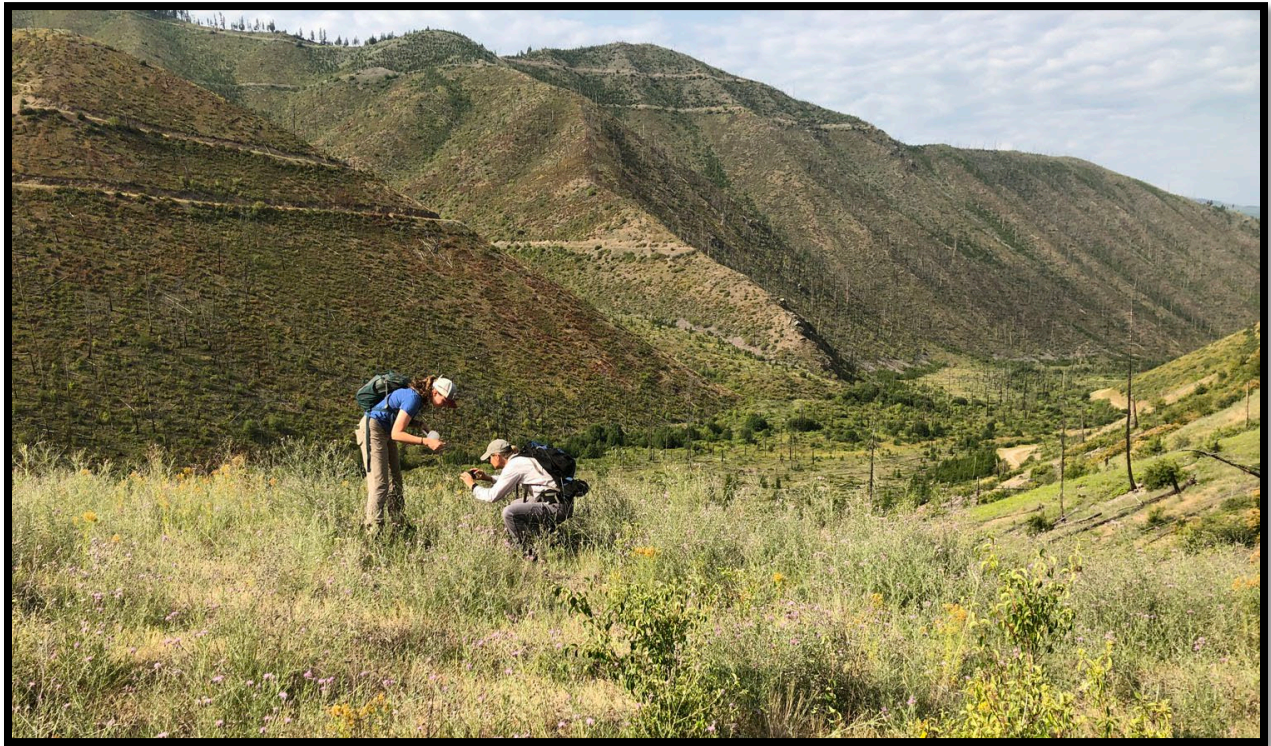
Figure 3. FWP wildlife biologist, Liz Bradley and a Missoula County Youth Weed Crew member releasing spotted knapweed seedhead weevils, Larinus minutus , in the Fish & Nemote Creeks WHIP project. Biological control agents along with herbicide and reseeding are all included in the weed treatment plan for this project.