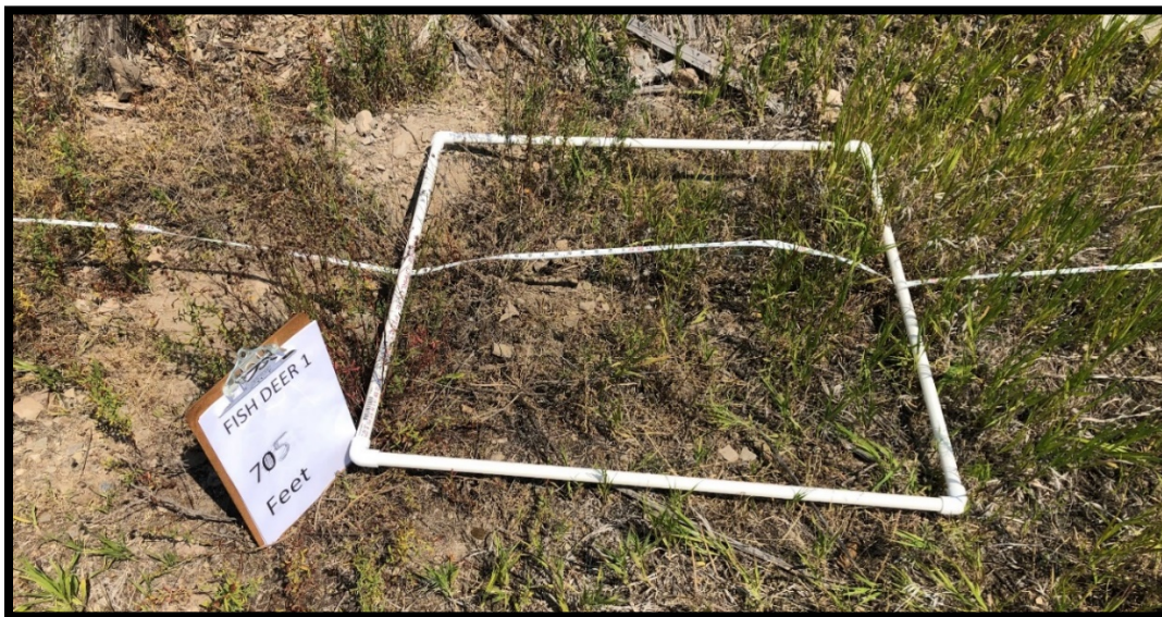
Figure 2. Vegetation transect established in the Fish & Nemote Creeks WHIP Project.

Vegetation Monitoring – A vegetation monitoring protocol was developed to ensure consistent monitoring across all WHIP projects and to help project sponsors evaluate change in plant communities over time. Vegetation monitoring is a required component for each WHIP project. Project sponsors select monitoring sites at representative locations within treatment areas. A transect is established at each monitoring site (Figure 2) and monitoring data is collected and reported yearly. Each site is monitored on a standard schedule, which differs by treatment type. Herbicide and reseeding projects require monitoring out to 3 years post-treatment. Weed treatments that have a slower plant response time, such as prescribed grazing and biocontrol, require longer monitoring periods of up to 10 years post-treatment. Biocontrol monitoring also documents the ongoing presence of biocontrol agents on the target weed.