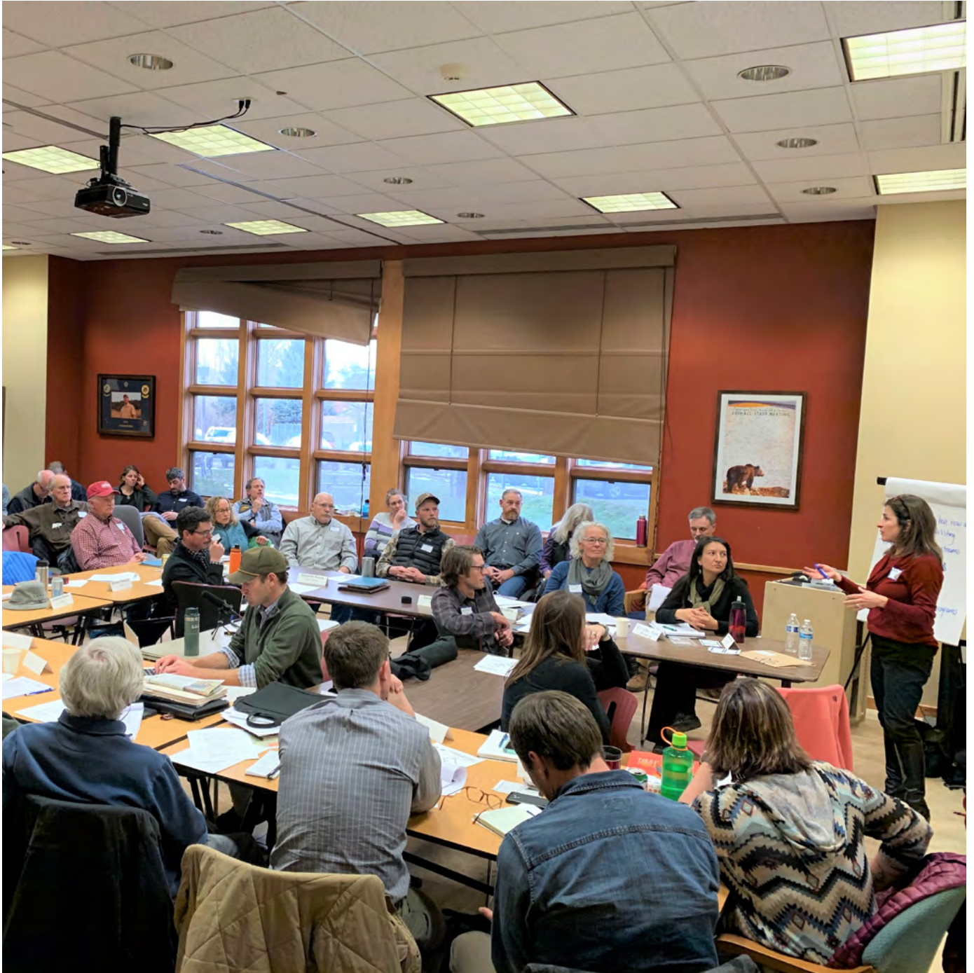
GBAC Bozeman Meeting