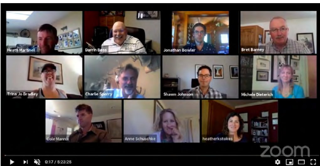
Due to Covid 19, the Council met virtually nine times from March-August 2020.

18. Relevant agencies should periodically review interagency Memorandums of Understanding (MOUs) for opportunities to improve efficiency and capacity for conflict response.