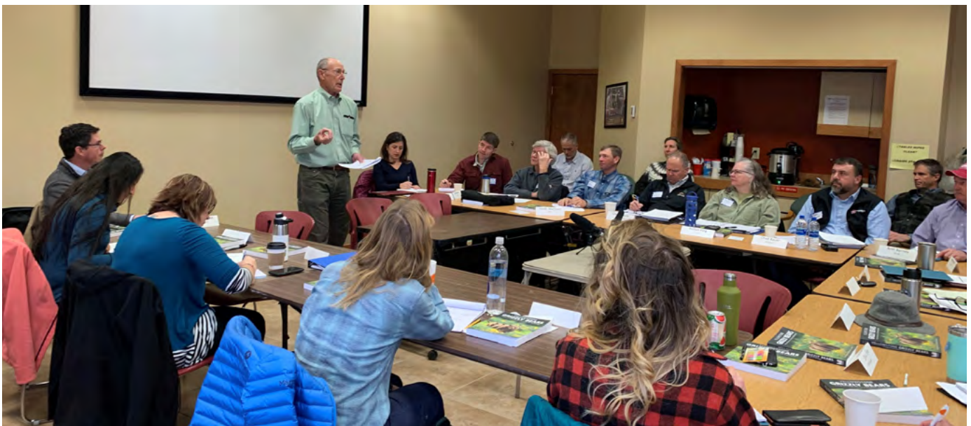
GBAC Bozeman Meeting